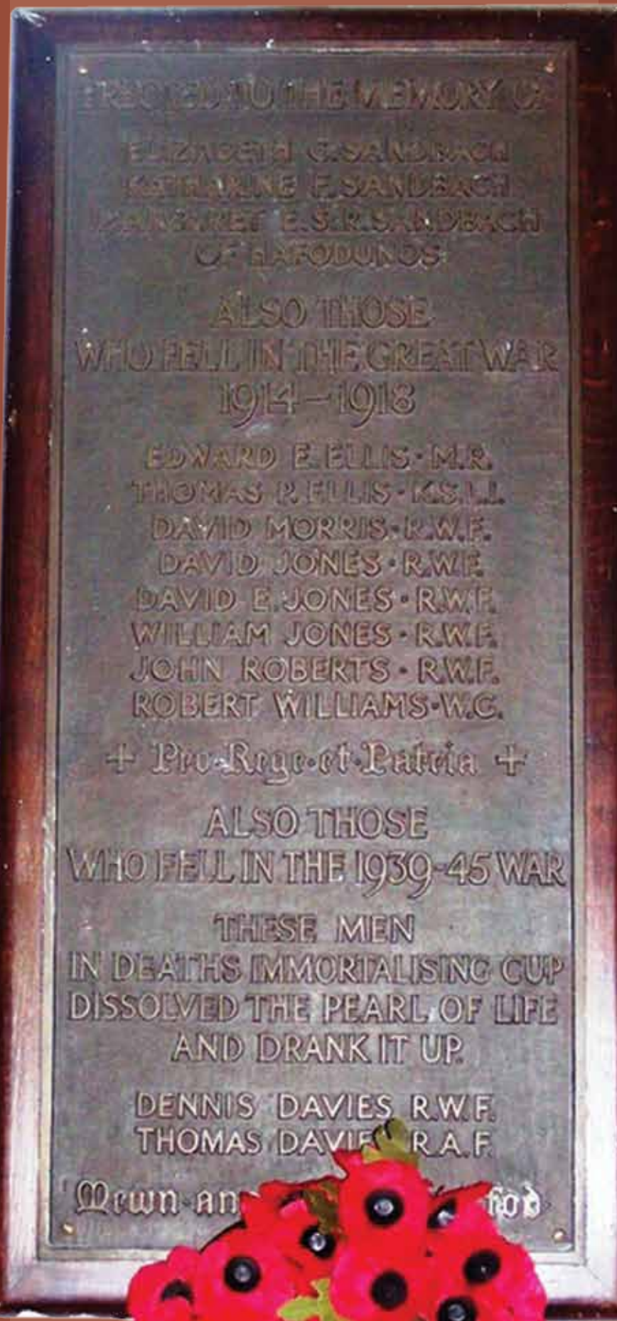
Plac Coffa Memorial Plaque